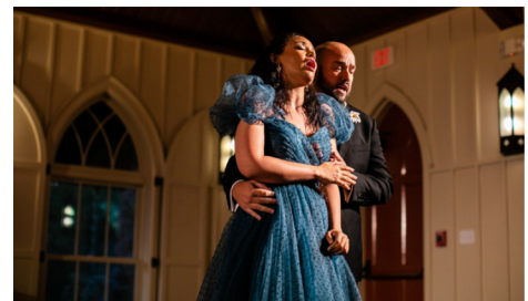
Guild Hall & Bel Canto Boot Camp Resident Artist Series, The Potions of Love: Bel Canto Arias and Ensembles, at St. Lukes Episcopal Church in East Hampton, NY, July 20, 2022.