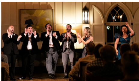
Guild Hall & Bel Canto Boot Camp Resident Artist Series, The Potions of Love: Bel Canto Arias and Ensembles, at St. Lukes Episcopal Church in East Hampton, NY, July 20, 2022.

The Guild Hall & BCBC Resident Artist program is generously funded by the V. Atkins Foundation.